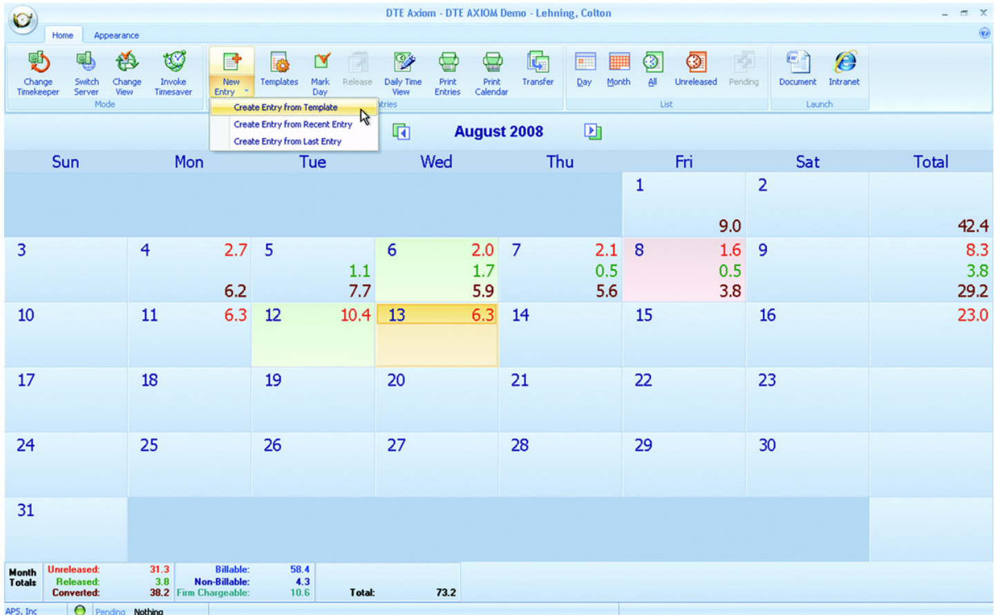
Figure 2. DTE Axiom calendar-based interface

DTE Axiom presents users with a familiar look that simulates the latest Microsoft Office 2007 interface. The calendar-based home screen uses modern software controls, ribbon toolbars, and drop-down menus just like many other programs users have worked with for years. See Figure 2.